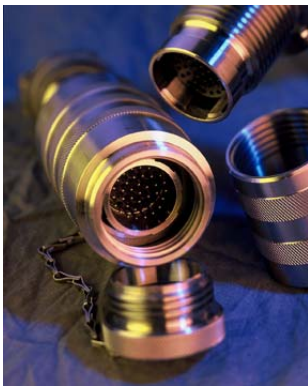
Vantage Explosionproof Connectors

Vantage Technology was founded in 1997 with the charter to manufacture electrical connectors for use in hazardous locations. With the strength of established product lines and a staff of experts in the field of explosionproof safety and design, Vantage set forth to meet the market's requirements for strong customer service and a safe and reliable product.